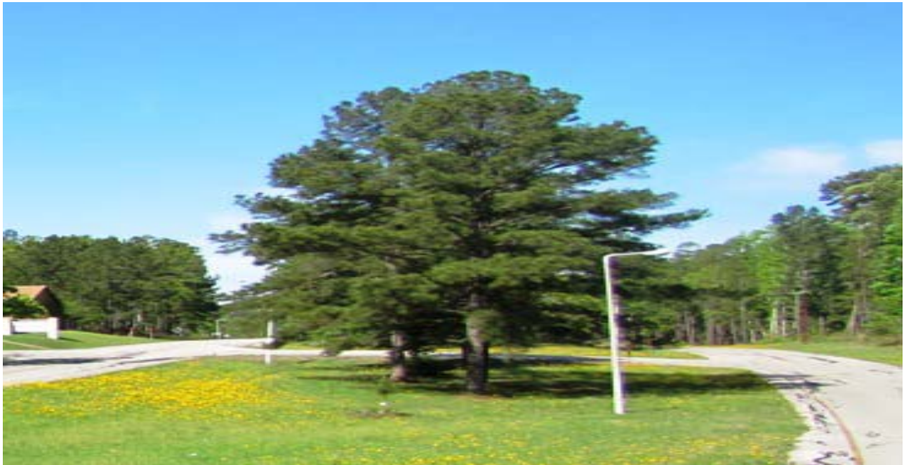
Wild Flowers on the Parkway