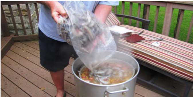
Adding the Shrimp