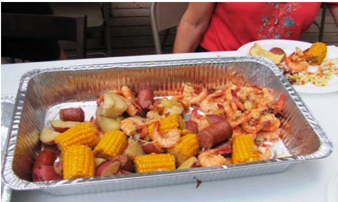
Come and Get It !