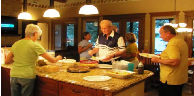
Looking Good !!