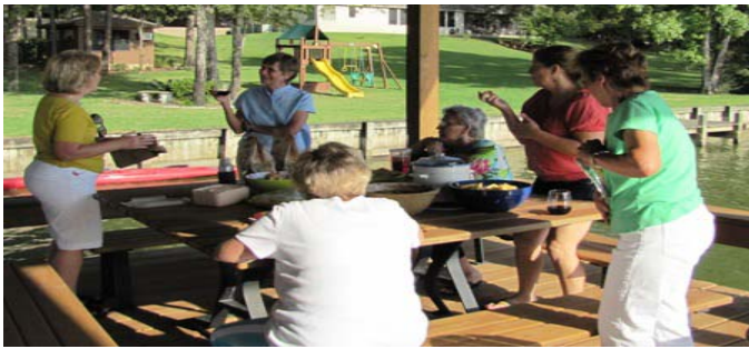
Did You Hear About...?