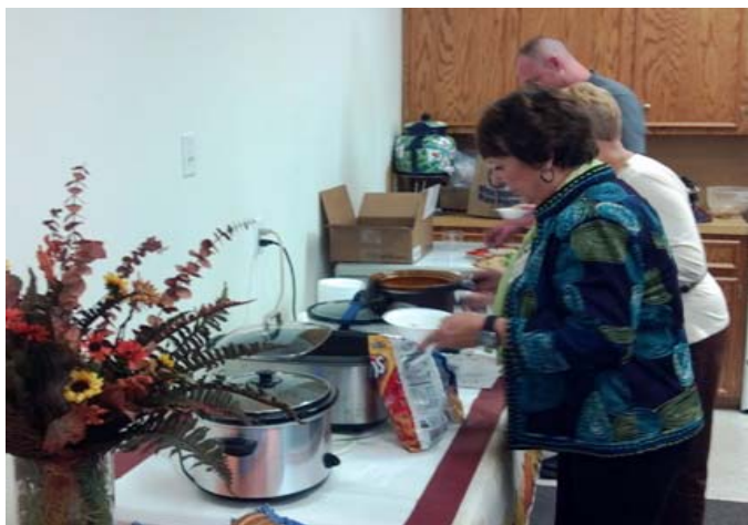
Food Looks Good