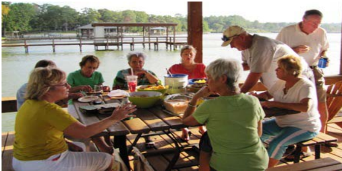
A Great Day for a Meeting