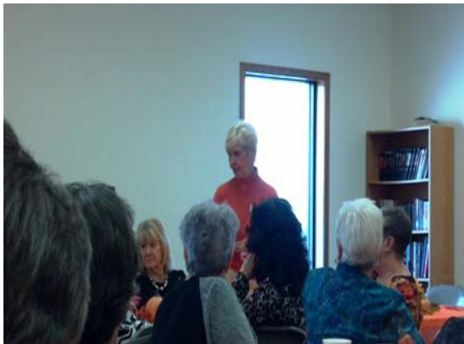
I Move That.....