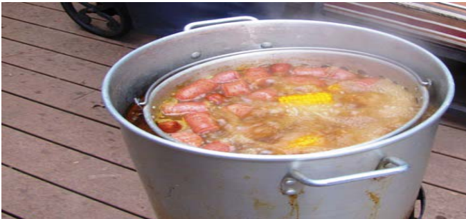
Cookin' the Stuff