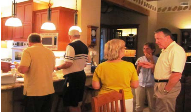
Save Some for Me