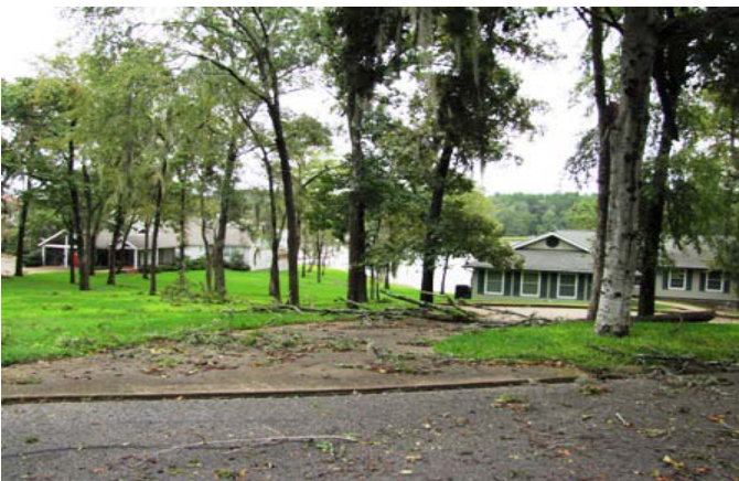
Front Yard Debris