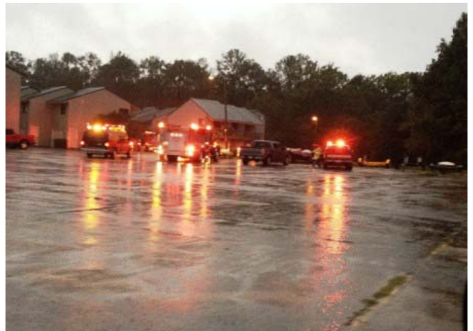
Lightning Fire in Bass Boat Village