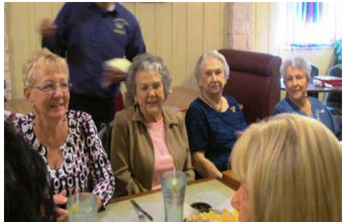
That is a Good joke

The next WWL meeting will be held on Wednesday, November 13 th . The members will tour the Sam Houston Statue and Museum, south of Huntsville on the East side of I-45. Lunch and a meeting will follow at Dosey Doe's Café in Conroe.