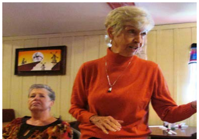
"The reason is....."