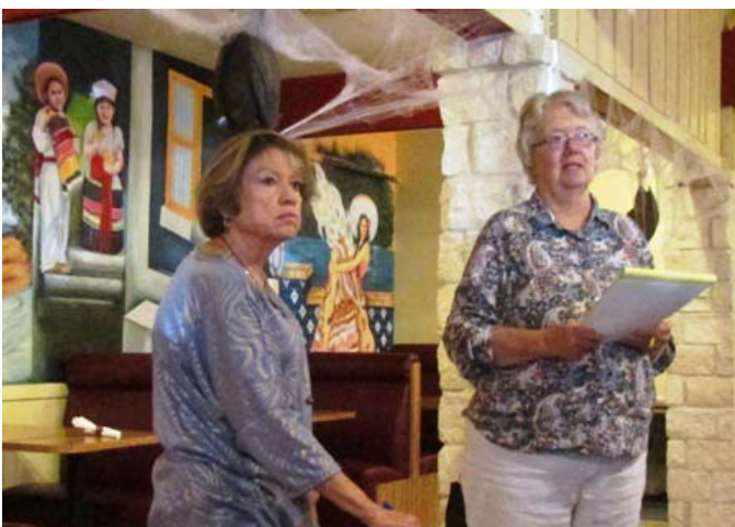
The Prez says.....