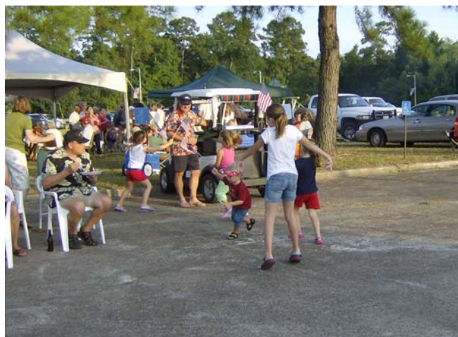
ROCKING AND ROLLING