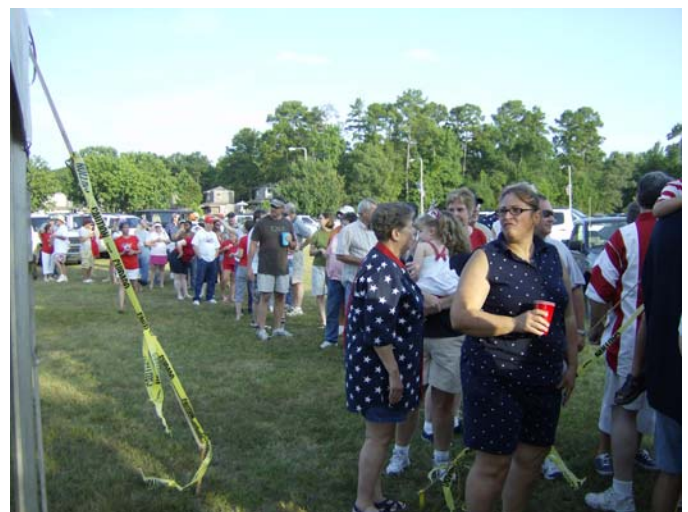
WHERE'S THE FOOD?