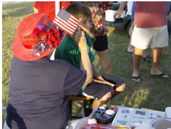
FACE PAINTING BY WANDA