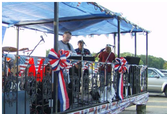
THE BAND PLAYED ON