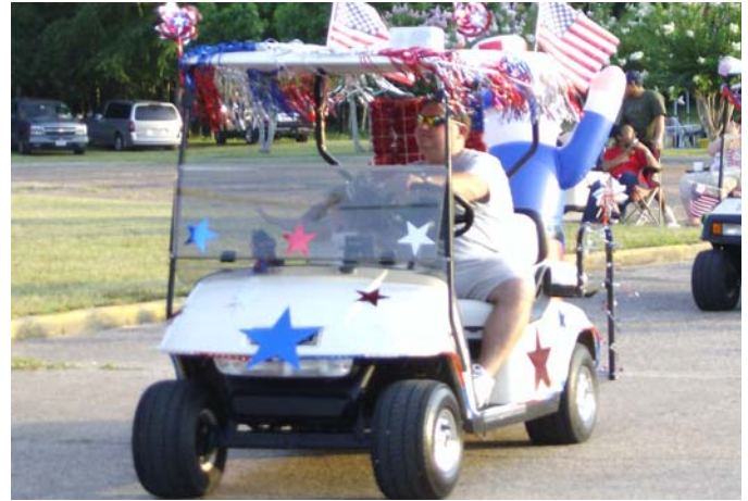
HERE COMES THE CARTS