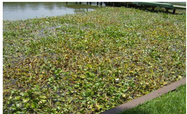
After Herbicide Spraying