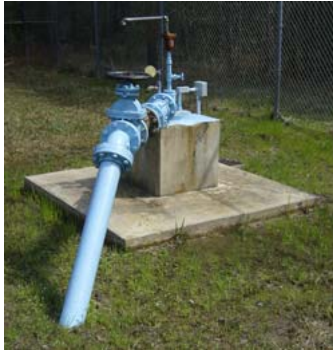
Waterwood MUD Well #1 Pump

of our water storage tank off of FM 980. Number 1 well is located adjacent to the storage facility and Number 2 well is about 600 yards south of the area. The wells have over 250 feet of casing and are powered by 135 gallon per minute (gpm) pumps. Pump #1 is used once per week in the winter and 3 days per week in the summer months.