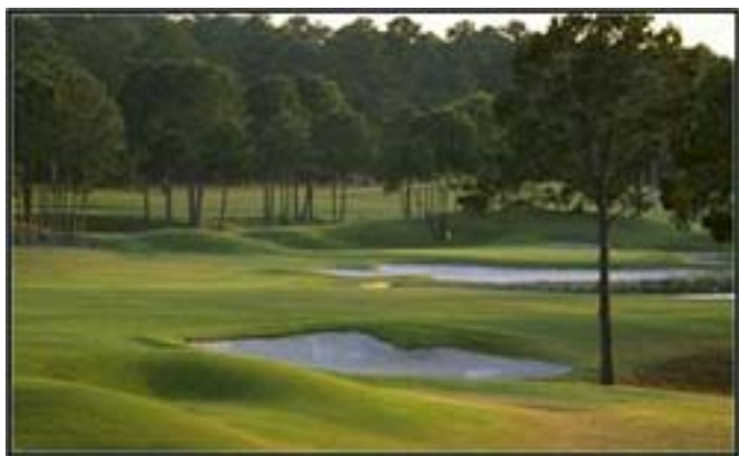
The 4th Hole at Waterwood National