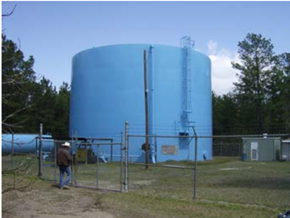
Waterwood MUD Storage Tank