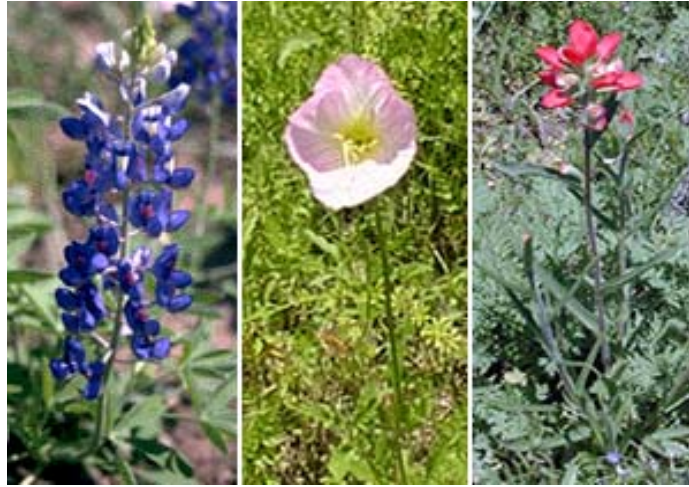
Bluebonnets, "Buttercups", and Indian Paintbrushes are Blooming In East Texas

The Texas wildflowers are blooming. Now is the time to take your spring drive through our area to see some of nature's finest displays of spring color. The following Internet pages give helpful information on this special time of the year.