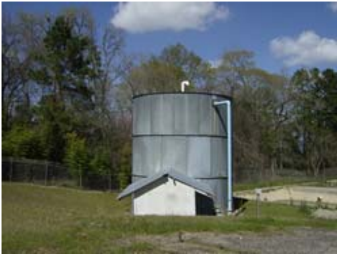
Waterwood MUD Clean Water Tank