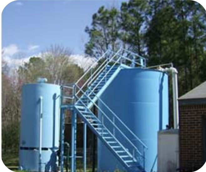
Waterwood Municipal Utility District Water Processing Plant